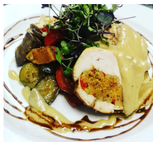
Bleu Berri Concept Catering